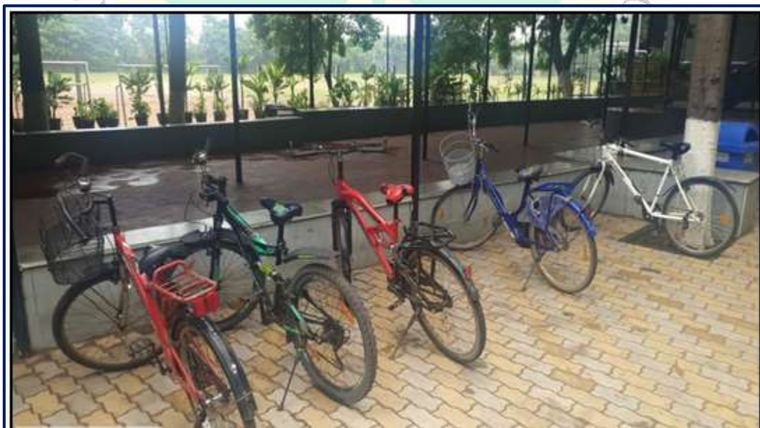
Bicycles Parking Lot