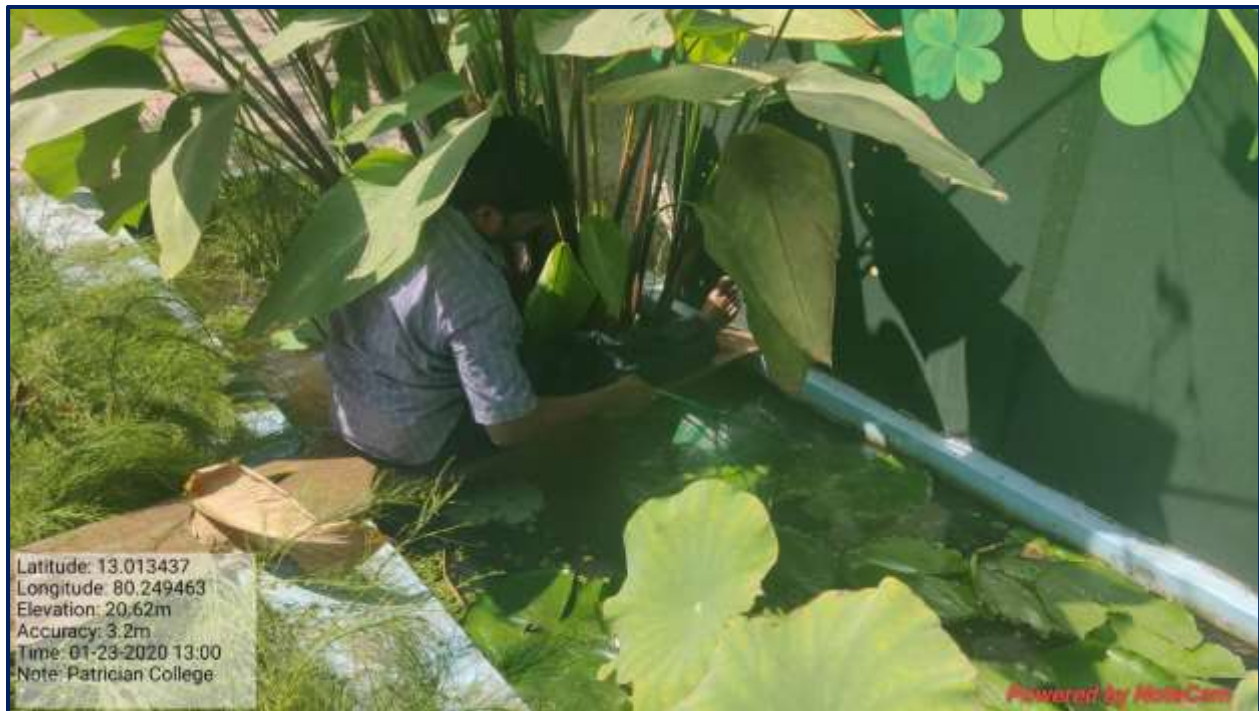
Green Cover Entrance to D- Block